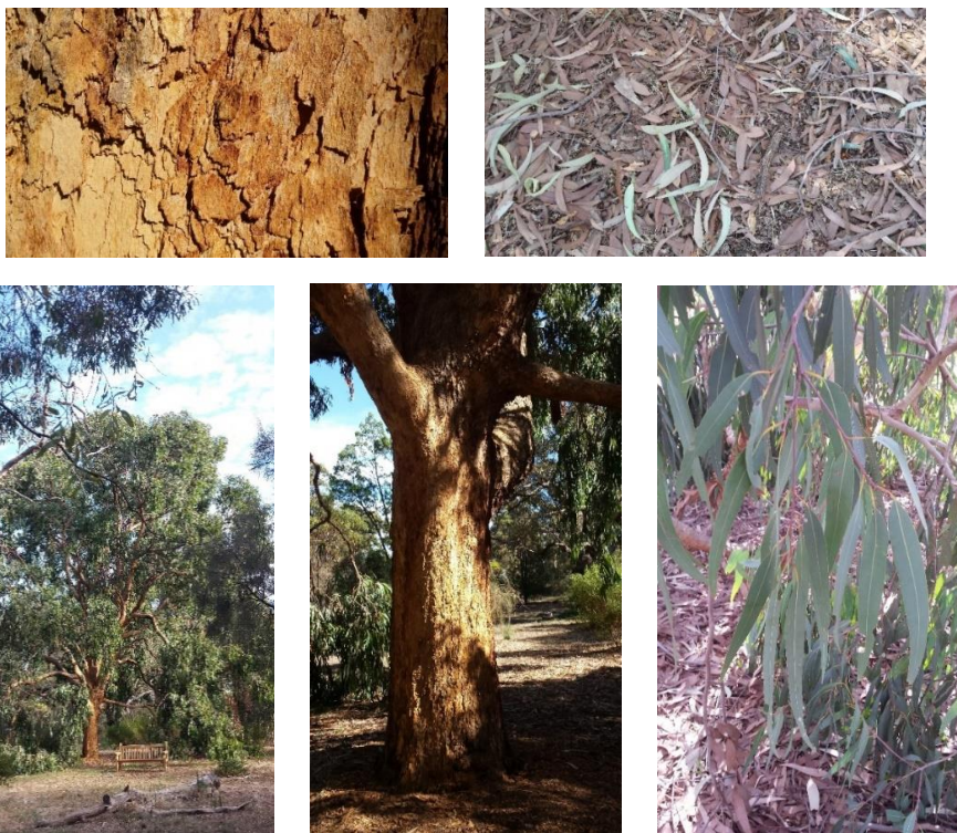
#1639 C3 Corymbia eximia Yellow Bloodwood MYRTACEAE N.S.W. 1951