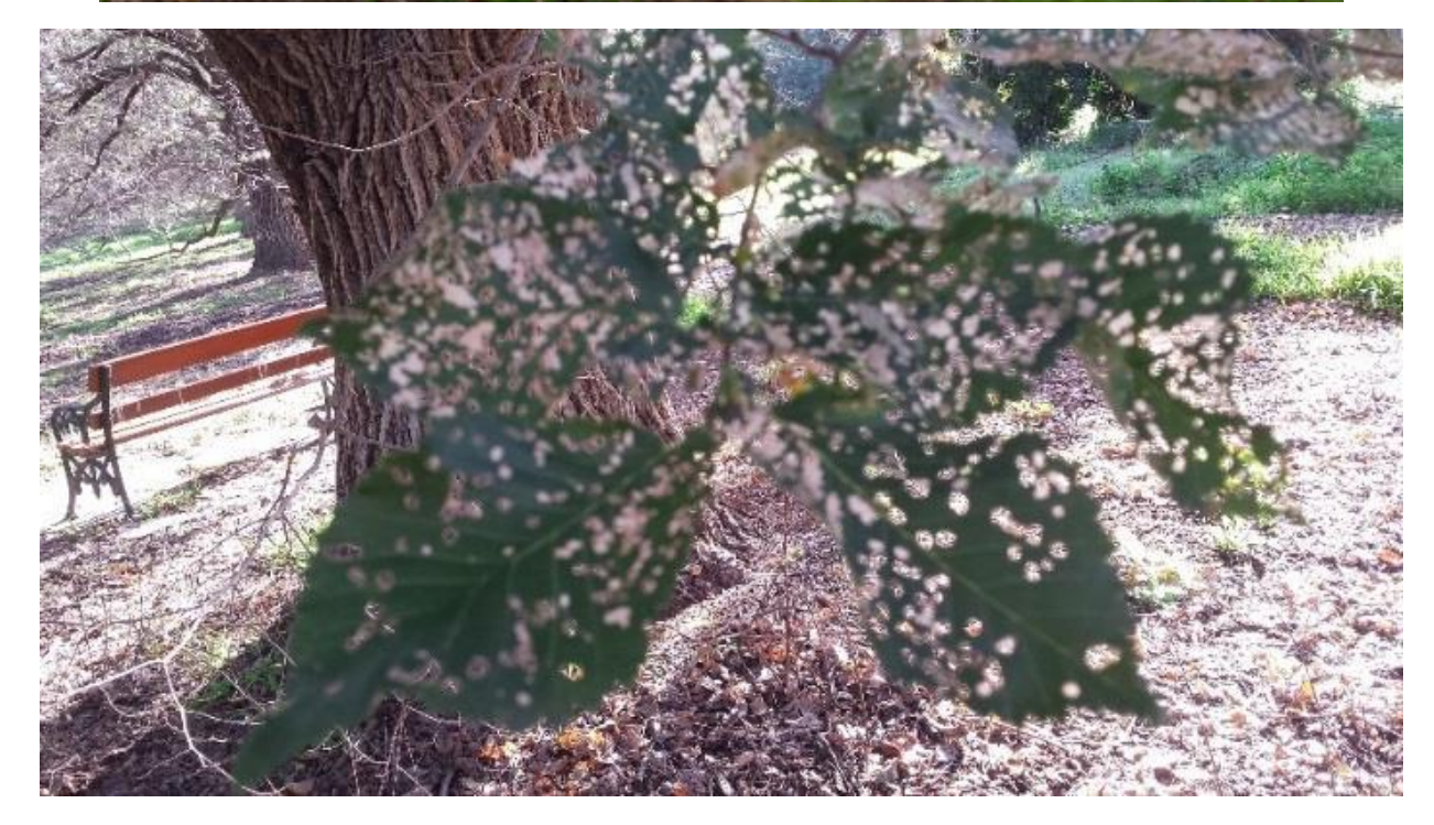
Species nameplate: English Elm #1168 is located on the left hand side of Elm Avenue from Walter Young Drive Elm. Right - #1153 tree 'skeletisation' caused by Elm Leaf Beetle (May 2016)