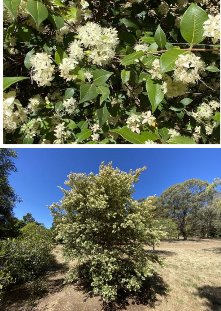
Backhausia myrtifolia Carrol, Grey myrtle, Neverbreak. MYRTACEAE ACT, N.S.W Qld 2005. Grows in subtropical rainforests of E. Australia. The plant produces oils with cinnamon-like aroma that has anti-bacterial and anti-fungal properties.

Eucalyptus perangusta Fine-leaved mallee MYRTACEAE WA 1988 Endemic to a small area on the south coast of WA. The bark is smooth throughout, pale grey and tan, shedding in thin curly flakes. Grows in the sandplain heath and has narrow leaves compared to other eucalypt species, with a distinctive crown.