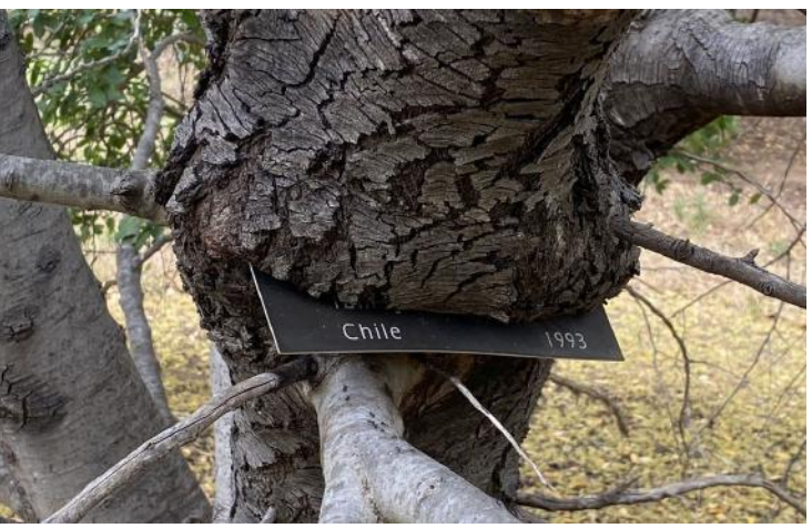
Quillaja saponaria Soapbark Tree Chile 1993 Nice tasty nameplate!