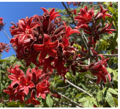
Brachychiton bidwillii Nine specimens (from five species) in the DRG will be moved to new locations when the Gate House move is finalised. Also the Sterculia (1), Planchonella (1), Myrsine (2) and Jaegera (3)

Relocating the Gate House to the Dry Rainforest Garden will provide the Arboretum with a wonderful shared space for the Volunteers and Friends groups. All of the specimens currently in that location will be relocated or replanted with new specimens elsewhere in the Arboretum. Nine specimens (from five species) in the DRG will be moved to new locations when the Gate House move is finalised. We are watering these plants now to give them a health boost prior to the move. All other specimens in the DRG will be removed but replaced with new, young specimens as they were deemed not possible to move (too big, not healthy enough to survive a move). Where we are unable to locate new specimens from acceptable suppliers, we have tried to propagate them from cuttings with mixed success so far. We will keep looking to ensure we are able to replace every specimen. We have documented the growth of each of the DRG specimens so we have a record of their performance in that area over 20 years. The new location has been carefully considered with regards to the microclimate in the new sites, and the practical realities of the project. There will be significant ongoing time costs for the Arboretum team to provide daily watering and care for moved plants and the new plantings. We have the new sites all mapped out ready. We are waiting on DIT to advise us when the activity will commence.