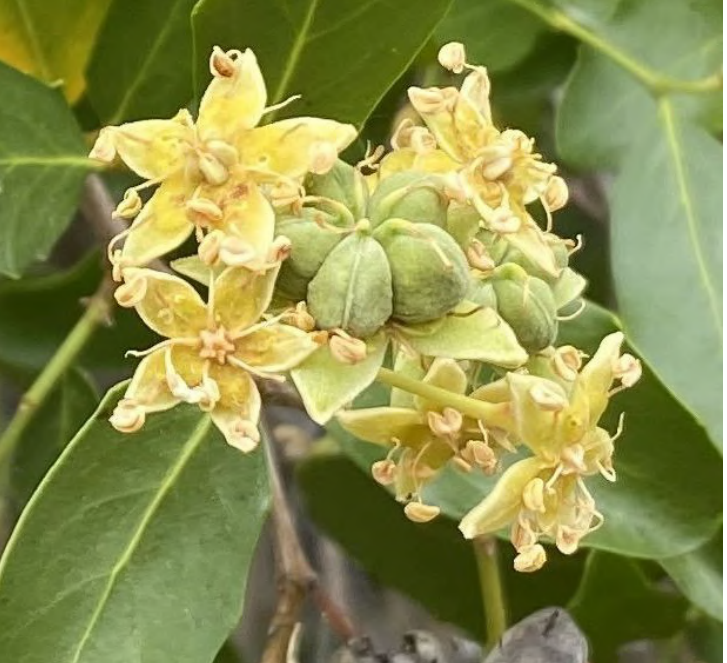
The dry fruit has five follicles each containing 10-20 seeds.