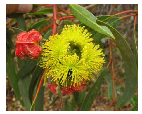
Eucalyptus erythrocorys, Illyarrie, flowers profusely. The red-capped buds are in groups of three and each of the large flowers has four tufts of golden stamens. It commonly grows on limestone soil and adapts well to pruning.