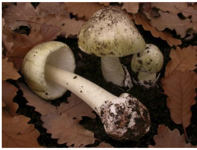
Death caps, Amanita phalloides

Autumn is death cap season. You are warned not to pick or touch any fungi in the Arboretum. Nearly all (about 90%) of deaths relating from mushroom consumption come from eating death caps which can be mistaken for the culinary straw mushroom.