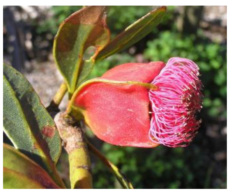
Eucalyptus tetraptera, the four winged mallee has attractive red buds, flowers and fruits. The buds and fruits are square with wings at each edge. The very large (up to 25 cm) leaves are glossy and leathery and are the thickest of all eucalypt leaves.