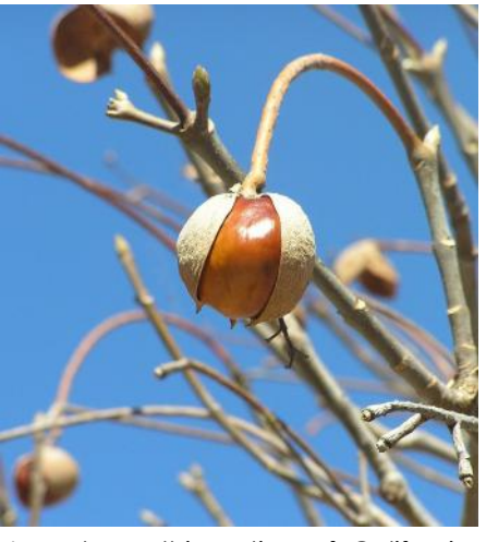
In autumn this native of California has large, glossy fruits hanging from bare, silvery branches. The nuts of Aesculus californica, the Californian buckeye contain a neurotoxin which causes the red blood cells to rupture. Native Americans ground the nuts and used them to poison streams, stunning fish and making them easier to catch.