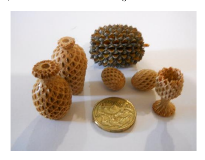
Assortment of objects turned from Sheoak cone and a typical cone .

darker wood, looking much like eyes. Common to South Australia is the silver banksia, Banksia marginata . Although quite small (it was difficult to find one big enough to turn an egg), it is harder and darker and quite attractive. I am sure that other species would create interesting forms.