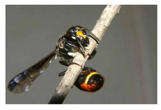
Hyleoides concinna

Arboretum bee wall: leafcutter bees, resin bees and mud wasps have made their nests in the blocks (top), close-up of one of the blocks (left), detail of nest of the common wasp mimic bee, Hyleoides concinna (right)