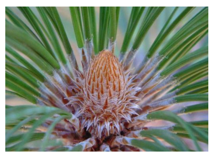
Chir pine bud (above) and Chir pine cone (below)

Canary Island pine, Radiata pine, Aleppo pine and Maritime pine. They are dominant pioneer species as their cones are stimulated to open by fire and sufficient to produce pure stands. Canary Island pines in the Arboretum were conspicuous by the way they have recovered from the fire six years ago, through their unique capacity to coppice and produce adventitious shoots along scorched branches.