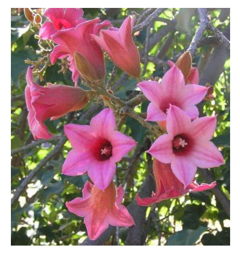
The Lacebark, Brachychiton discolour, carries its spectacular pink velvety flowers in clusters at the end of branches. The seed capsules contain many large seeds surrounded by irritant hairs.