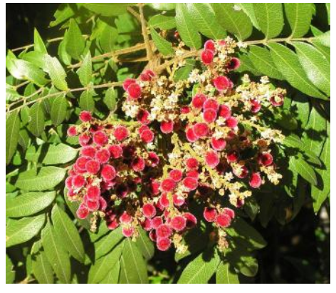
Jagera pseudorhus, Foam bark is native to Qld and NSW. Aborigines used the bark and leaves as a fish poison. The saponin content blocked oxygen uptake by the fishes' gills.