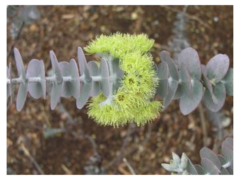
Eucalyptus kruseana, the Bookleaf mallee, is notable for its closely-spaced, stemless rounded leaves and greenish yellow flowers. It is rare, only occurring in three hilly areas east of Kalgoorlie but not currently listed as endangered.