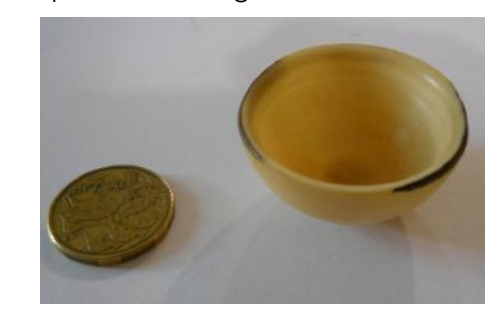
Vegetable ivory bowl

expensive is in high demand for netsuke carving.