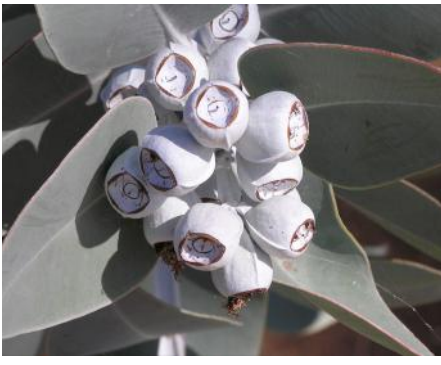
The Tallerack, Eucalyptus pleurocarpa, has a spreading habit with many small branches arising from a lignotuber. The square, ribbed fruits and smaller branches are white and waxy. The flowers are white with the stamens clustered in four groups, one at each corner of the gumnut.