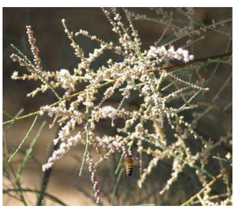
Tamarix aphylla, Athel, is a declared weed in arid parts of Australia where it has spread along inland watercourses and is outcompeting native vegetation. It tolerates saline and alkaline soils and spreads both by seed and suckering. It limits competition from other plants by taking up salt from deep ground water, accumulating it in the foliage, and then depositing it in the surface soil where it builds up concentrations harmful to some plant species.