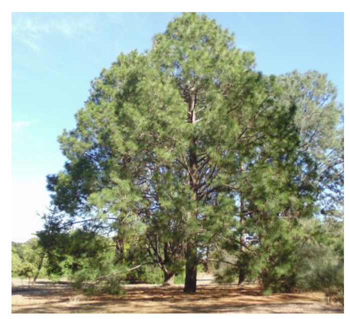
Chir pines in the Waite Arboretum.

The Chir pines in the Waite Arboretum were planted in 1944 in a group of three, donated as seedlings,