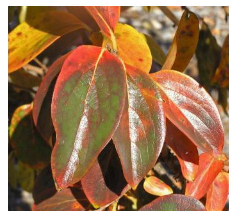
Autumn colours on the leaves of Diospyros virginiana, the American persimmon a native of south-eastern USA where it was cultivated by native Americans in prehistoric times. The ripe fruit is edible, a tea can be made from the leaves and the dense wood is valued for woodturning