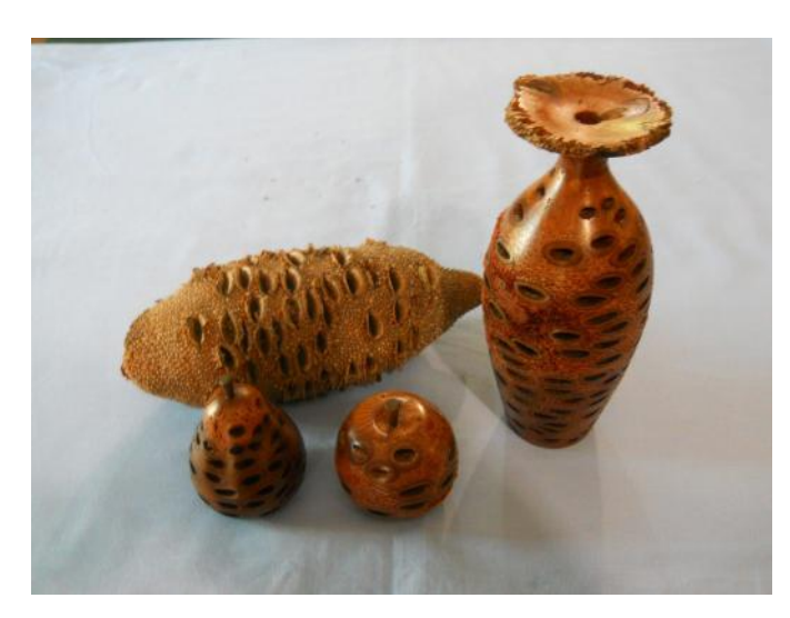
Vase, apple and pear turned from Banksia grandis cone

Some trees and shrubs have hard woody seed capsules – often called cones or nuts. I have had fun recently trying to turn many of these into common woodturning forms, some of which I will detail below.