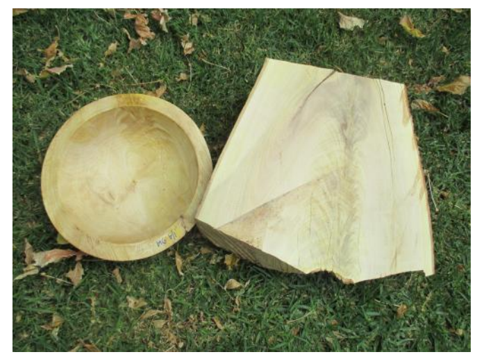
A section of figured grain obtained from a crotch in the tree.

Three of the species of Flindersia have been important cabinet making timbers in Australia. The most famous is Queensland Maple ( F. brayleyana ), a very popular furniture timber, especially in the 1960s. Maple Silkwood ( F. pimenteliana ) is very similar to Queensland Maple, often with figurative grain, and also sought after because of the beauty of its timber. Another is Silver Ash ( F. bourjotiana ) which as the name suggests has very white wood, giving an impression of silver.