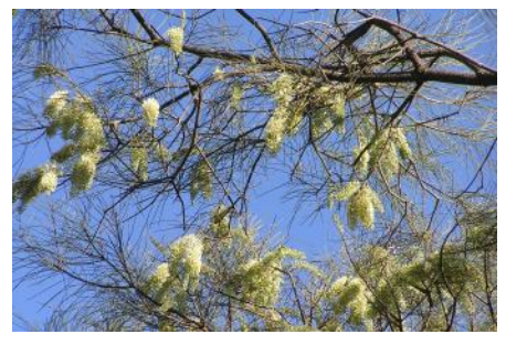
Hakea fraseri, Corkwood Oak grows on the dry and steep rocky slopes of river gorges. It is listed as vulnerable because of low population numbers and restricted distribution. Origin NSW, Qld.