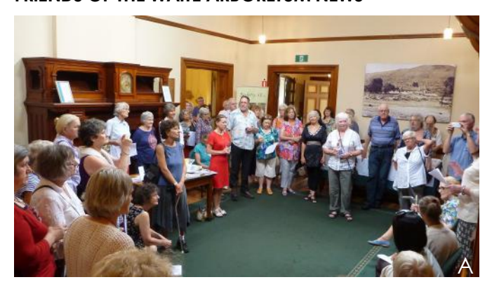
Basketry Exhibition opening address.