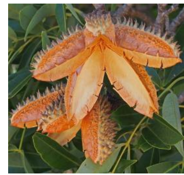
F. xanthoxyla dry fruit. F. australis dry fruit

The fruit are typical of most species of Flindersia, consisting of usually five boat shaped capsules, the back of which is covered by blunt prickles. They are very similar to those of the Crows Ash (F. australis) but are more delicate and papery in texture. The individual capsules all contain two winged seeds up to 50 mm long.