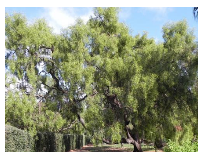
Acacia salicina in the Waite Arboretum Australia; in particular the Murray-Darling basin where it grows along water courses (creek and river banks, beside dams and ephemeral wetland areas.

Acacia salicina (cooba) is common across eastern