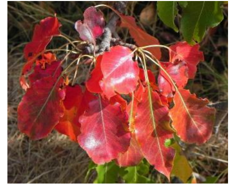
Pyrus salicifolia, Willow Leaved Pear has attractive flowers and bright autumn leaves. Origin SE Europe W Asia.