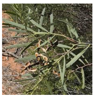
A. ligulata phyllode

collected long before the construction of the potential point source that initiated this aspect of the investigation revealed similar high levels of sulphur in members of the A. bivenosa group.