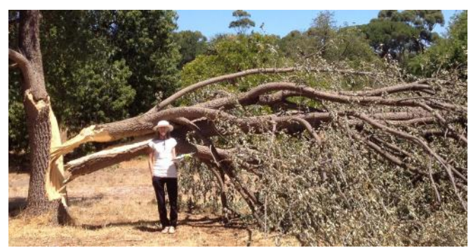
Fraxinus pennsylvanica #773 storm damage.

On the night of 3rd/4th February severe storms with wind gusts up to 100 km/h brought down powerlines and trees across Adelaide. A number of trees in the Arboretum were blown over or lost large limbs. It was very sad to see the damage to fine mature trees such as the Fraxinus pennsylvanica planted in 1950 and to our significant sugar gums planted by Peter Waite in 1877 at the entrance to Walter Young Avenue. Clean up is still under way and the Northern Turners led by Ron Allen are assisting by removing fallen timber for turning.