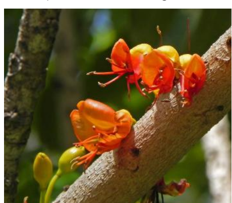
The bright orange flowers on Castanospermum australe, Black Bean, are followed by large pods with toxic seeds which were eaten by Aboriginal people after careful preparation. The seeds and foliage