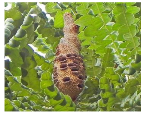
In autumn the brightly coloured flower spikes of the Banksias growing on the dam wall are followed by attractive dry fruits. Origin Australia.