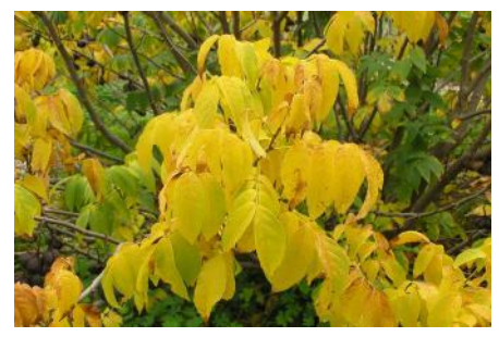
Mexican Buckeye, Ungnadia speciosa, is a small tree with fragrant bright pink flowers in spring. Fruit is a 3-lobed capsule with poisonous seeds. Autumn foliage is a golden yellow. Origin Mexico.