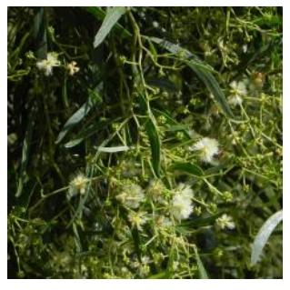
A. salicina phyllodes

The Arboretum specimen of A. ligulata has died but there are large, healthy specimens of A. salicina in the Waite Arboretum alongside Claremont Avenue. Phyllode samples from A. ligulata from the Arboretum specimen had concentrations of sulphur and calcium of 1.7 and