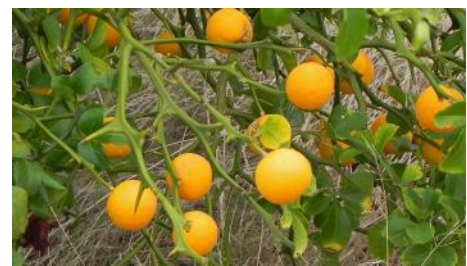
Poncirus trifoliata, Trifoliate Orange has deciduous compound leaves and is used as a rootstock for citrus. Origin China.