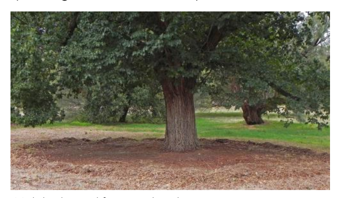
Mulch cleared from under elm canopy.

On the 15 January 2014 a fire started in inaccessible forest in the southern Flinders Ranges. The Bangor Fire, as it came to be known, burned out of control for 30 days and destroyed in excess of 35,000 hectares with a perimeter of more than 200 kilometres. 90% of the Wirrabara Forest was burnt including the historic Wirrabara nursery, established in 1877. Forestry SA has initiated a collaborative project to re-establish the Wirrabara planting. The Waite Arboretum has provided seeds of Grecian Juniper Juniperus excelsa and many other uncommon species to forest ranger Sam Everinaham. Horticultural students from Urrbrae TAFE with lecturer John Zwar will also collect and propagate Arboretum material of interest for replanting in Wirrabara Nursery.