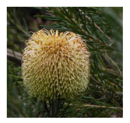
The banksias on the dam wall flowered very well this summer and autumn and now have interesting dry flower spikes.