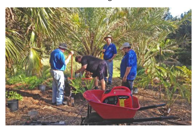
Palm and Cycad working bee, planting the new cycads.

On a happier note, the Palm & Cycad Society held a working bee on 23 February and a number of Mexican cycads donated by members were added to the collection along the watercourse.