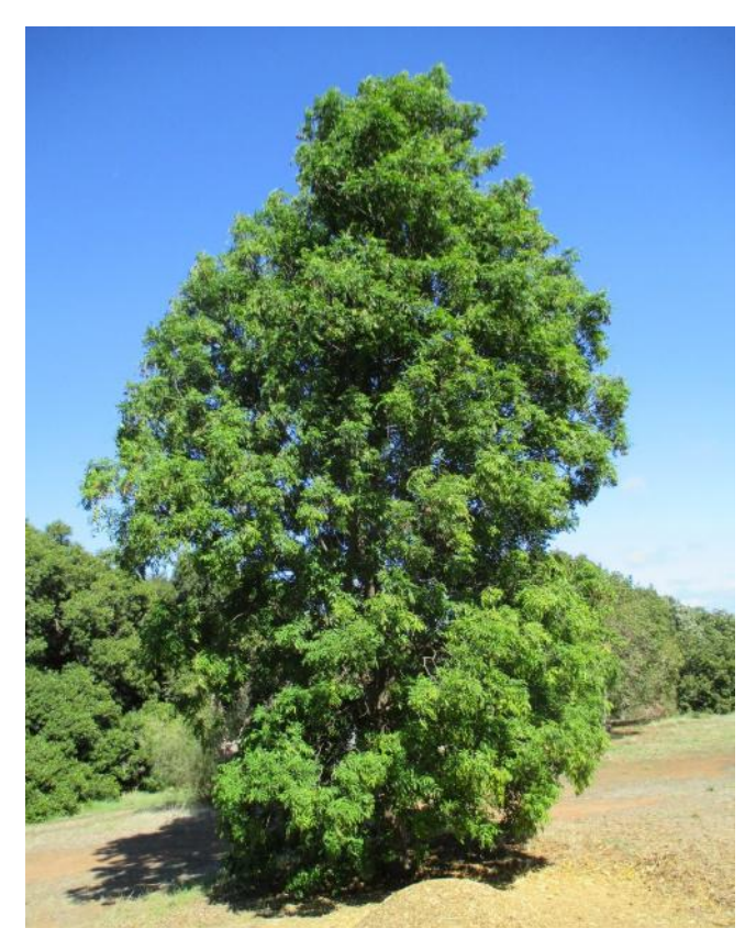
Flindersia xanthoxyla

It was such a sad sight to see that one of the Yellow-Woods in the Waite Arboretum had been vandalised. What a mindless act!