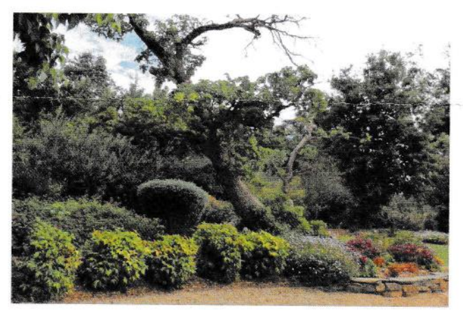
The 100 year old Mulberry tree. LC

The 100 year old mulberry tree takes pride and place in the midst of a young garden. A living treasure from a bygone era sharing its life with other collectable assets in the garden's progress of connecting with its past and future.