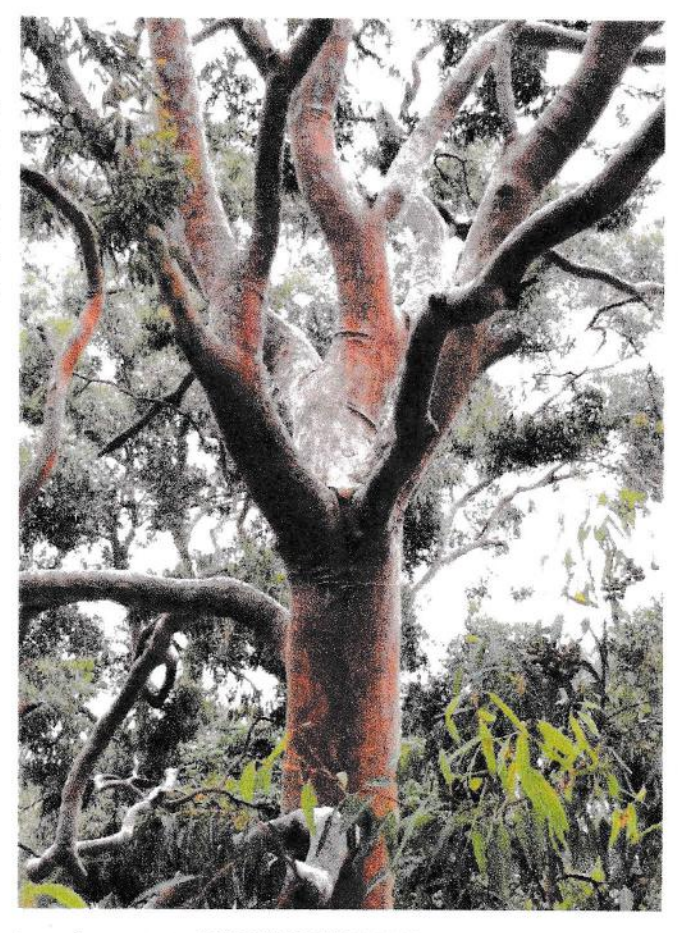
Angophora costata MYRTACEAE NSW #189

In total there are 21 specimens of Angophora in the Arboretum comprising 7 species and three hybrids. There is an attractive grouped planting of them just west of the watercourse near the 'Owl Pole'. Why not visit it and compare the characteristics with the nearby Eucalyptus species and enjoy their beauty.