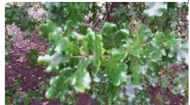
Left #408 Quercus pubescens Willd. Downy Oak FAGACEAE, S. Europe, Caucasus 1972