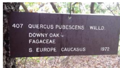
Left #408 Quercus pubescens Willd. Downy Oak FAGACEAE, S. Europe, Caucasus 1972 Right #407 Quercus pubescens Willd. Downy Oak FAGACEAE, S. Europe, Caucasus 1972