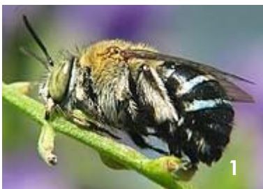
Blue Banded Bee, Amegilla sp. (11mm).

The bee hotel is situated near the Mallee section on the right hand side of the walking path along the watercourse towards the water birds sculptures from Walter Young Avenue (entrance opposite the car park).