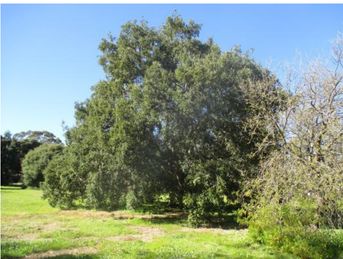
Cork Oak at the Waite Arboretum.

During preparation for a guided walk at the Waite Arboretum for the Treenet Symposium in September 2014, I became interested in Cork Oak as a special tree.