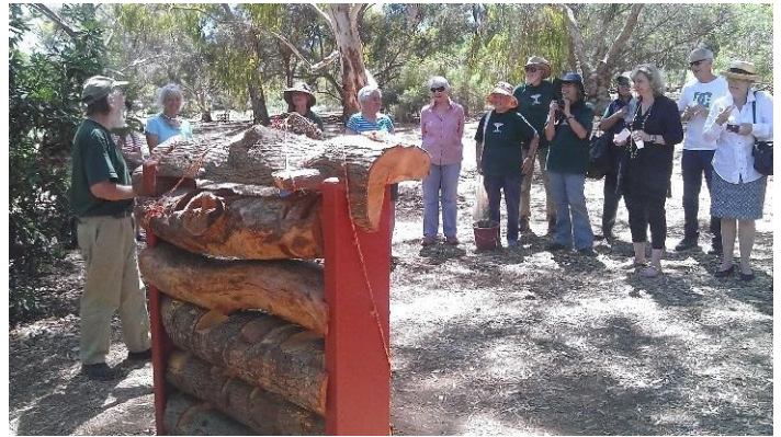
Waite Arboretum Bee Hotel launch on 9th December 2014.

rammed earth and various mixtures of clay and sand can be used.