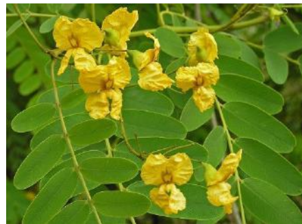
Tipuana tipu , Yellow Jacaranda is an attractive deciduous tree with 'helicopter' seeds. It is very adaptable and fast-growing and is listed as an environmental weed in Qld. Origin Bolivia, Argentina.