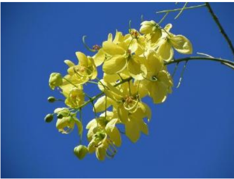
Cassia fistula , Golden Shower Tree is the state flower of Kerala in India and the national flower of Thailand, where the yellow colour symbolises royalty. Origin India, south-east Asia.