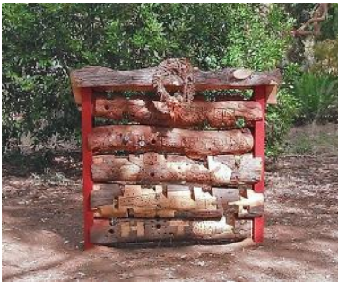
The completed Waite Arboretum Bee Hotel with launching wreath.

The Waite Arboretum Bee Hotel is a recently installed 'five star' accommodation complex for solitary native bees in the Waite Arboretum.