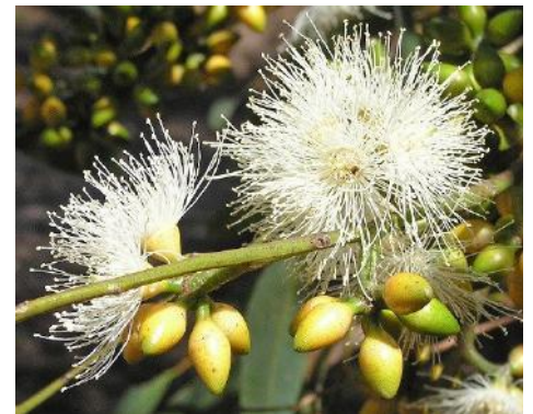
Eucalyptus pumila , Pokolbin Mallee is a very rare species and is only known from one locality in the Hunter Valley. It is a small multi-trunked tree that flowers profusely. Origin NSW.