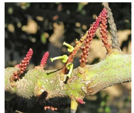
Ceratonia siliqua , Carob has been cultivated for its edible pods and seeds for thousands of years. Trees are usually either male or female. Above, fruit has begun to set on this female tree. Below, the green and ripe pods. Origin Mediterranean.