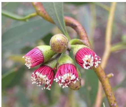
Eucalyptus nutans , Red-flowered Moort included in the list of Declared Rare Flora of WA. It is a small mallee which is known from two areas on the south coast. Origin WA.