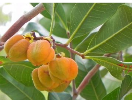
Cupaniopsis anacardioides , Tuckeroo. The fruit is the favourite food of many birds and the tree is a food plant for the larval stages several butterfly species. It is planted in parks, gardens and along streets. It is tolerant of strong, salty winds. Origin NSW, Qld.