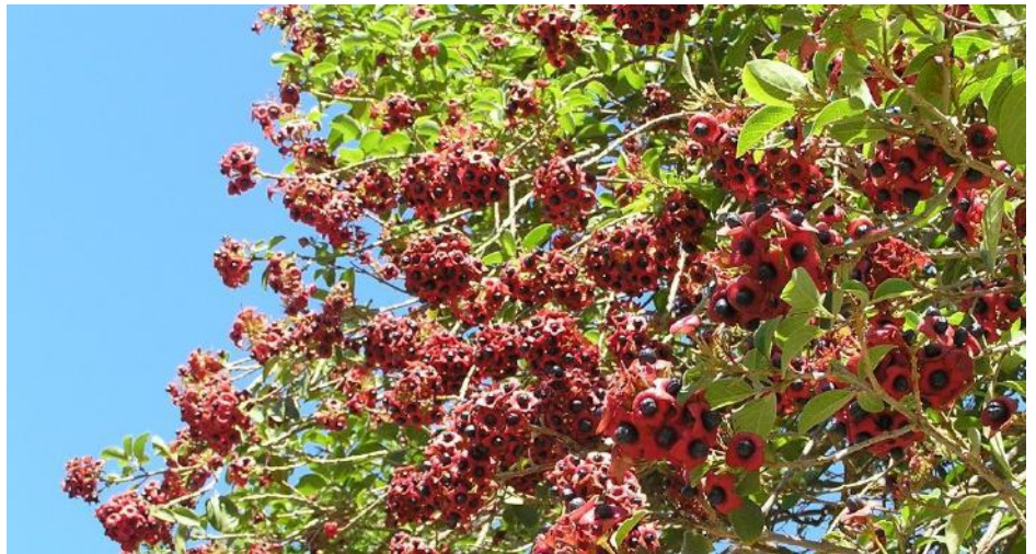
Clerodendrum tomentosum has white flowers which are pollinated by moths. The petals drop leaving a fleshy red calyx and shiny navy blue, four lobed drupe. The tree attracts birds and butterflies. Origin NSW, Qld, NT, WA, PNG.