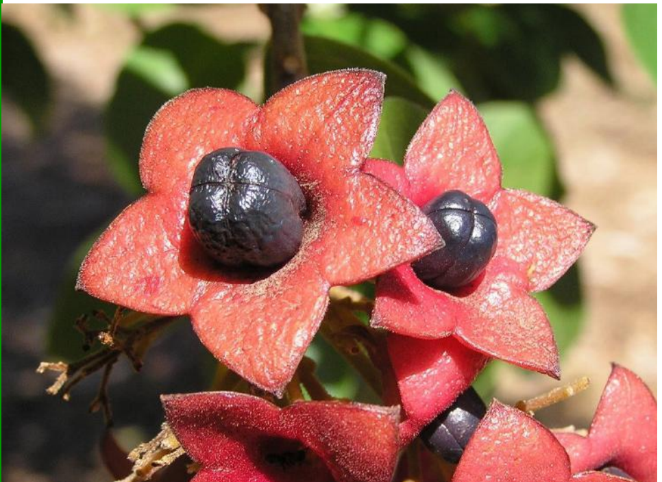
Clerodendrum tomentosum , Lolly Bush