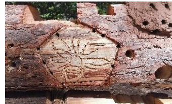
Blue Banded Bee

The timber logs of the bee hotel have had holes drilled into them to form bee nesting accommodation. Nest materials such as paper straws can be placed into the drilled holes and bundles of nesting materials can be placed into the larger holes of 16mm and 40mm as well as the sawn rebate sections.