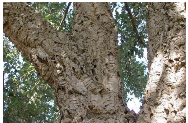
Thick bark of Quercus suber #431.1 planted 1954.

Cork Oaks are evergreen Oaks with quite small leaves. They create light dappled shade which allows grass to grow under the canopy. They are considered to be clean trees with little leaf drop. The trees are fire resistant, undoubtedly because of the qualities of the bark and minimum leaf litter. The evergreen oaks are collectively known as live oaks, especially in the USA. The leaves are very similar to those of the Holm Oak, also known as Holly-leaved Oak ( Quercus ilex ). They are variable in shape but usually oblong with serrated edges. They are glossy