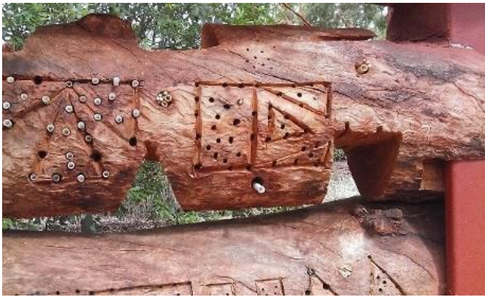
Nesting holes, 'T' 8mm diam, 150mm deep, 'E' 5mm diam 120mm deep.

A number of these drilled holes form nesting 'homes' for the native bees and some of the holes can have various nesting materials placed into them for example paper straws, bamboo, and some native grasses. Rebates were cut into the top and bottom of the logs to allow placement of nesting materials.