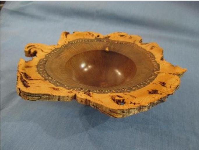
Bowl showing Cork Oak bark.

Cork Oak and Holm Oak are two of the trees which are preferred for truffleries. Truffles form a symbiotic relationship with trees. Traditionally pigs have been used to find truffles in Spain and Portugal, although dogs like Beagles are now commonly used.