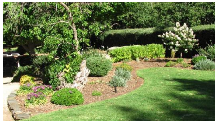
The Garden today.

Laurel and Tomai started to collect bags of wet manure, green waste and winter leaves from the streets of Adelaide to fill the dug-out trenches. This has been a mammoth task, as many hours have been spent collecting resources and digging with a mattock. Most people, especially volunteers, would have given up at this stage, but not these two wonderful young women. Since April 2012 it is calculated that they have dug into the area 187 bags of manure, which they carried to the garden from various places in the boot of Laurel's small car. Along with this, they have collected and delivered countless bags of fallen leaves and green waste. Doing this has allowed the enrichment of the soil to develop a garden that now gives pleasure and provides space for reflection and relaxation.