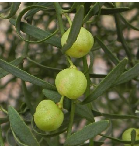
Citrus glauca , Desert Lime. The small, edible fruit have a strong lime-like flavour. It is heat, drought and cold tolerant and hybridises with other citrus species. Origin arid Australia.