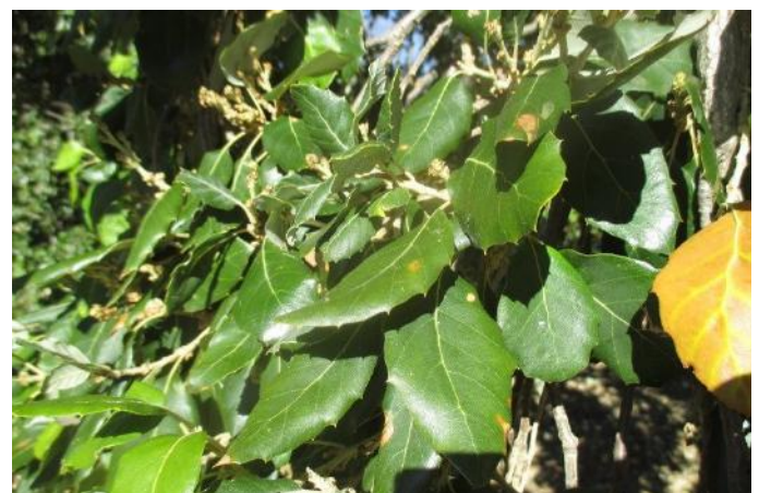
Cork Oak foliage.

The acorns form a very important part in the production of the famous Spanish ham jamón ibérico . After weaning, piglets (black Iberian Pigs) are fattened on barley and maize for some weeks and then allowed to forage amongst the Oak trees until close to slaughtering time, when they are fed on a rich diet of acorns. The hams from the slaughtered pigs are salted and left to begin drying