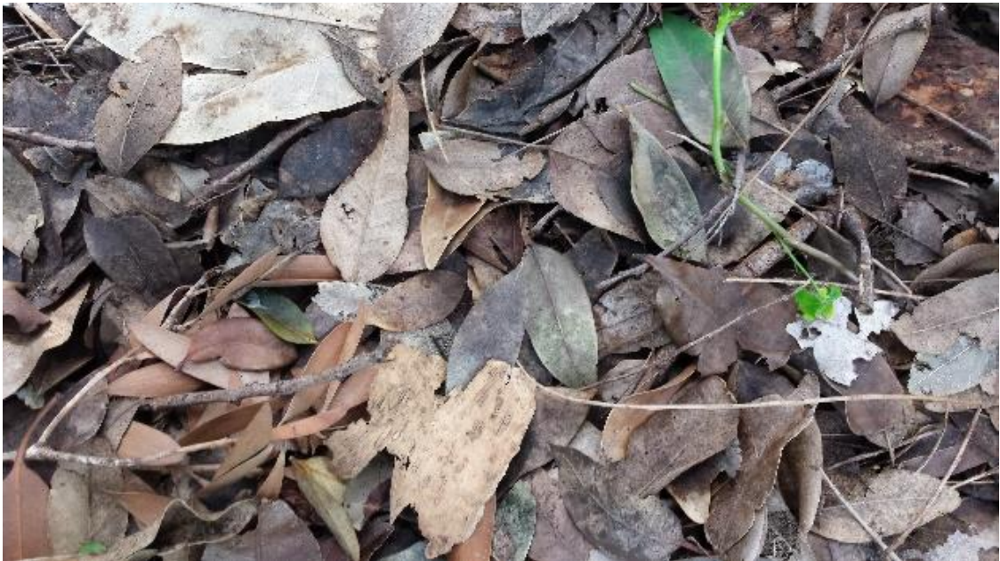
#107 Cassia brewsteri F. Muell. Cigar Cassia LEGUMINOSAE QLD. 1965