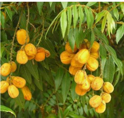
The fruit of the foambark tree, Jagera pseudorhus , is covered with stiff bristles which may cause skin irritation. The fruit splits open to reveal three segments, each with a shiny black seed (see below). Origin: NSW and Queensland.