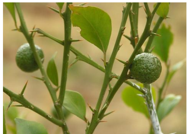
Citrus australis , Australian round lime, fruit.

Citrus australis (syn. Microcitrus australis ), Australian round lime or dooja is first group of citrus species plants you come across if you approach the citrus collection from along the track from Gate 13 and to the east of the large Pinus pinea , stone pine. Elliot and Jones (1993), describe this species as a tall shrub/small tree (4-12m x 2-5m) with a dense thorny form; small elliptical to ovate leaves, dark green on top and paler underneath. The flowers are small white or pink about 1cm in diameter and are solitary in the axils and, like most citrus, fragrant.