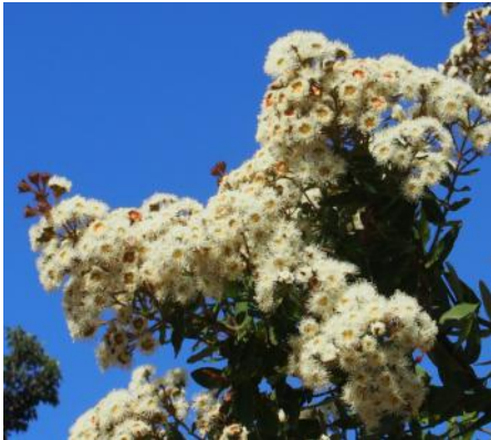
Masses of nectar-laden blossom on the dwarf apple, Angophora hispida attract colourful beetles and numerous birds. Origin: NSW.