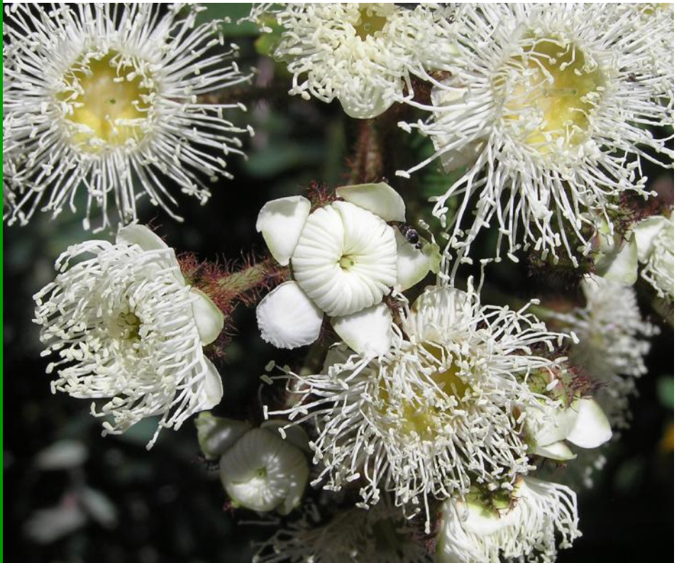
Angophora hispida . Photo Eileen Harvey