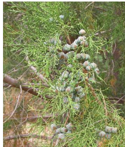
Tetraclinis articulata foliage and fruit.

Common names can be very confusing. The name thuya has no true connection to the genus Thuja , which contains the valuable commercial timber, Western red cedar, Thuja plicata , although both Tetraclinis and Thuja are in the Family Cupressaceae. Thuya is from the Greek, meaning sacrifice, because they used an oil distilled from it as incense in their religious ceremonies. Some churches still use it and as sandarac oil it is valued for medicinal uses.