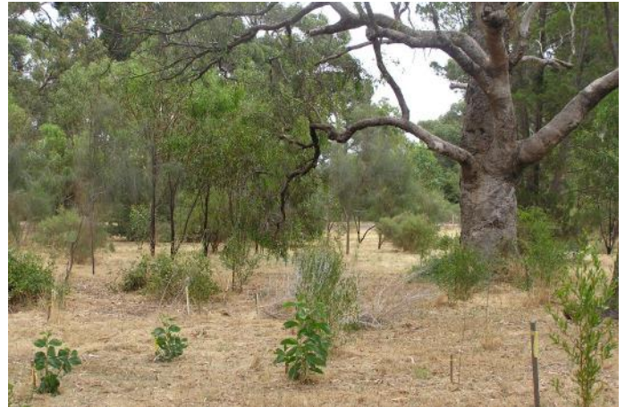
Remnant grey box tree.

out the weeds and help prepare the area for subsequent plantings of shrubs and understorey plants. Following a visit to the area mid 2007, Andrew Crompton recommended that further plantings of Acacia pycnantha and Allocasuarina verticillata be made in order to thicken the current plantings, preparing the ground for more successful plantings of the understorey in the future.