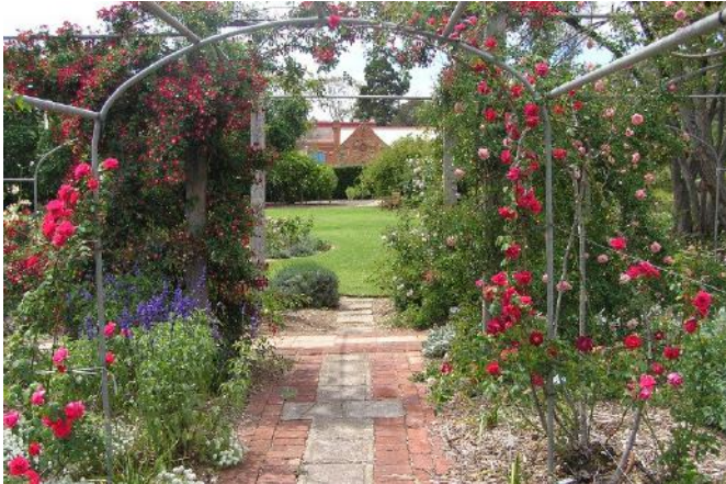
The Rose Garden.

It was a pleasure to welcome the 84 delegates attending the International Conference of the Mediterranean Garden Society to the Arboretum and Gardens on 27 th October. The Rose Garden looked stunning and the visitors loved the Garden of Discovery which the South Australian branch of the MGS have adopted as a project.