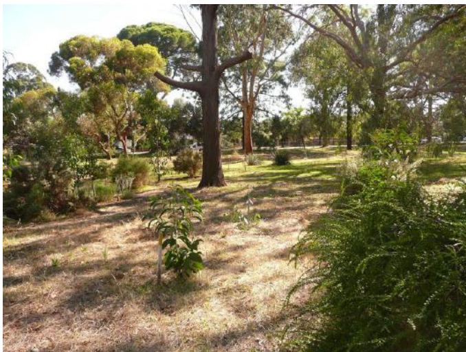
Part of the revegetation area.

By 1880 the Black Forest had been almost completely cleared and no intact grey box forest remains on the Adelaide Plains. In the NW section of the Arboretum are three remnant grey box which are thought to predate European settlement. In 1998 a vision was developed to reintroduce the native understory species around the remnant grey box and not to replant any of the introduced eucalypts or conifers when they reached the end of their natural lives. In this way the Arboretum would contribute to the survival of one of our original SA habitats.