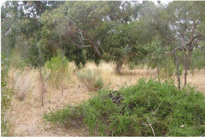
Acacia acinacea , Allocasuarina verticillata and grasses growing well.

plantain. There does seem to be less couch and kikuyu, though.