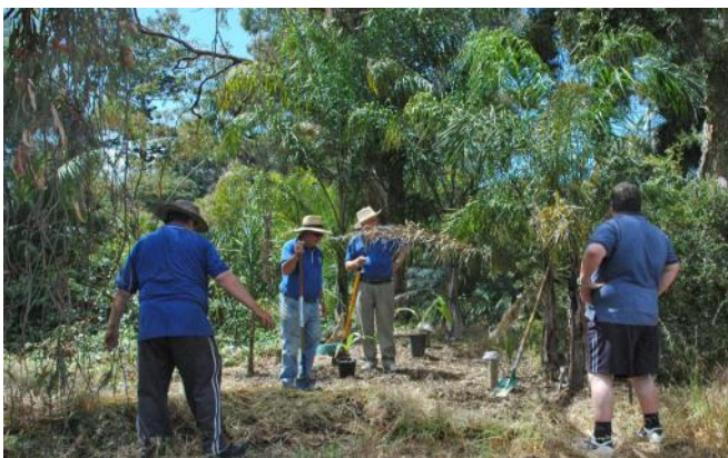
Members of the Palm and Cycad Society working in the collection.

In December, the Palm and Cycad Society held a working bee and carried out weeding and watering of the collection. Despite the very hot weather