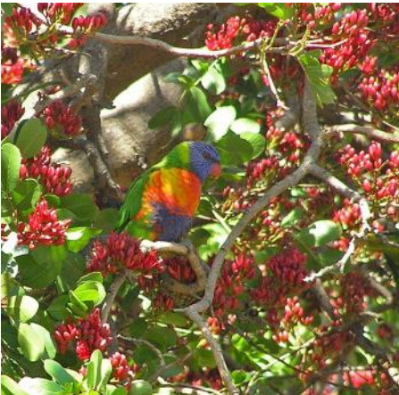
Rainbow lorikeets use their bristle-tipped tongues to feed on the abundant nectar of the weeping boer-bean, Schotia brachypetala . In late summer the flat, brown woody seed pods split to reveal large seeds with a conspicuous aril. Origin: South Africa.