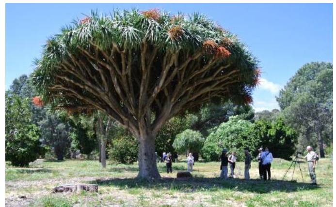
A group of MGS members hearing about Dracaena draco from an Arboretum guide.

amazed to see many trees they recognised growing so well on the natural rainfall. The oak collection was much admired, as was the iconic Dracaena draco . An overseas member was so taken by Jennifer's brooch of the D. draco that she asked for one to be made and was thrilled when it was delivered to her only three days later. The Arboretum tours finished with great excitement in the grey box revegetation area when an obliging koala allowed itself to be photographed.