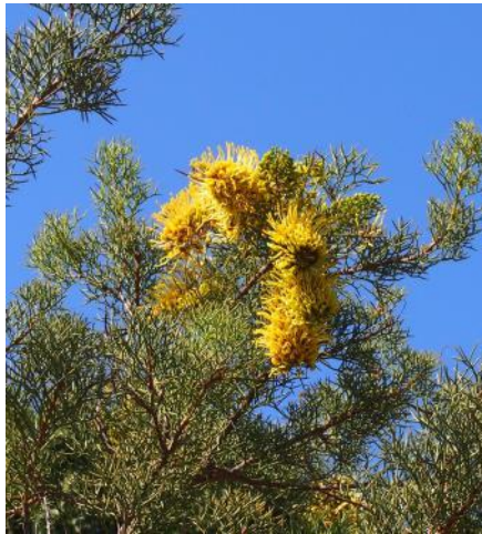
The tough, needle-like leaves and corky bark allow the corkwood, Hakea edneiana to grow in drier parts of Australia. Origin: SA, NSW.