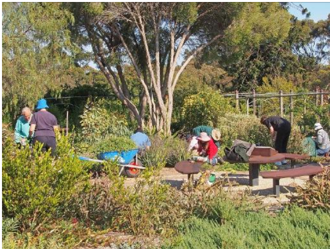
SAMGS members working in the Garden of Discovery.

It was a pleasure to welcome the 84 delegates attending the International Conference of the Mediterranean Garden Society to the Arboretum and Gardens on 27 th October. The Rose Garden looked stunning and the visitors loved the Garden of Discovery which the South Australian branch of the MGS have adopted as a project.