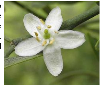
C. glauca flower

Citrus glauca (syn. Eremocitrus glauca ), the Australian desert lime is located on the eastern side of the citrus collection. It has the largest distribution of all native citrus occurring from south-west Queensland and western New South Wales to isolated pockets in the north of South Australia around Port Augusta and the Flinders Ranges. All our specimens are grafted onto citrus rootstocks. In the wild these trees range from small thorny, suckering, multi-stemmed shrubs of 2-3m high up to 8-12m tall rounded trees. They have very simple narrowly elliptical leaves with very sunken stomates and with hairs, similar to features found in other arid dwelling plants (Alexander, 1983). This citrus species, according to Alexander (1983), has the shortest time (approximately 2 months) from flowering to fruit maturity of those species within the Subfamily Aurantioideae, the subfamily, in which most cultivated citrus and citrus relatives belong. Fruits are globular to oblate, ripen to a yellow colour are edible mostly seedless and have an intense lime flavour. Look out for them they will be coming soon!