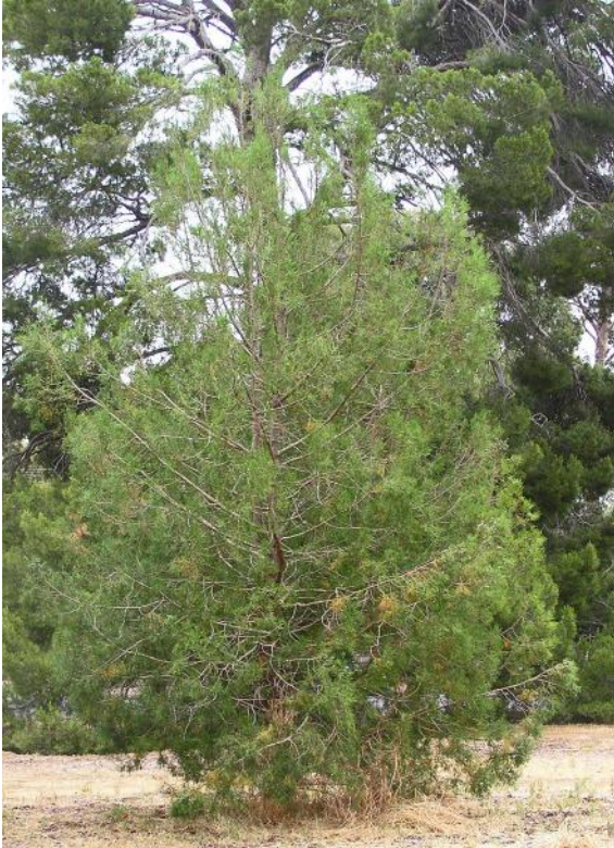
Tetraclinis articulata, Arboretum specimen #1023, planted 1989.