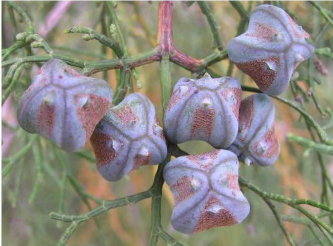
Tetraclinis articulata fruit.

Tetraclinis is included on the IUCN (international Union for the Conservation of Nature) Red List, and although the species as a whole is "lower risk, not threatened," the Maltese and Spanish populations are listed as highly threatened. There are a number of web sites which advertise the wood (as Thuya burl) for sale. One such site from the US which trades under "Exotic Wood Group" talks about the difficulty in obtaining the wood, claiming that unfortunately over harvesting has caused the Moroccan government to prohibit the export of Thuya burl wood and then finishes up with the rather glib statement – "So, you may ask, how did we get our stock? Well, we'll never tell!"