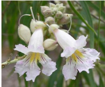
The deciduous desert willow, Chilopsis linearis , tolerates dry conditions. The large flowers range in colour from pale lilac to bright pink. Origin: Texas, Nevada.