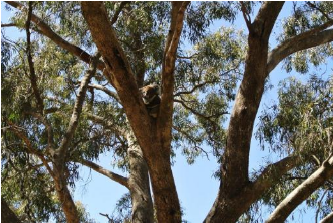
One of the koalas seen by MGS members in the revegetation area.

On the 28 th November I participated in the Great Koala Count and scoured the Arboretum. I found only the male in the NW corner just one tree away from where he was sitting the month before.