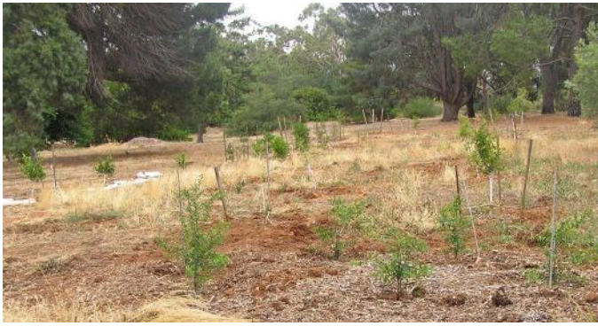
Australian native citrus collection.

Did you know that Australia has more remaining wild species of the genus Citrus than any other part of the world? Australia is not the centre of genetic diversity but it is in the unique position of having wild populations of native species which remain, to some degree, intact. This is in stark contrast to other areas such as Southern China and North East India, close to the centre of origin, where wild species have unfortunately been lost.