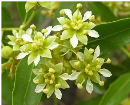
The evergreen soapbark, Quillaja saponaria , has dense corymbs of white flowers followed by a dry fruit with 5 follicles each with 15-20 seeds. The inner bark can be used as a soap or shampoo and extracts are used in perfumery. Origin Chile.