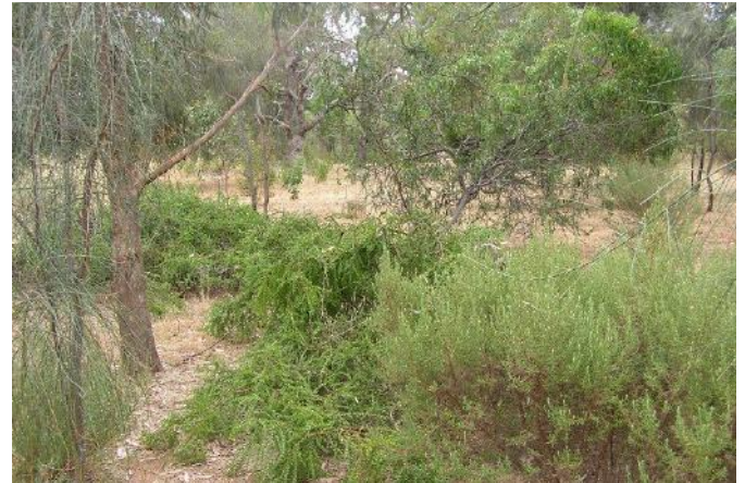
NW Arboretum with Black Forest understorey species.