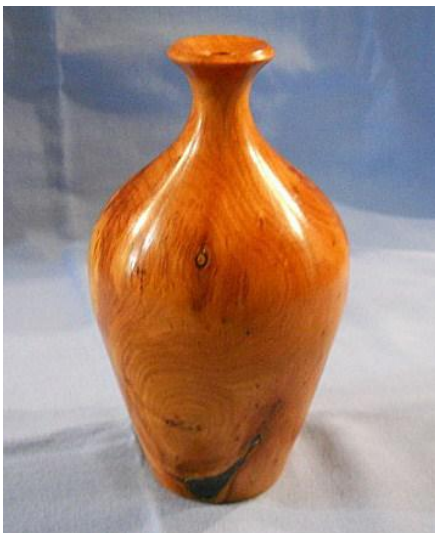
The vase showing grain and figuring.

Tetraclinis is included on the IUCN (international Union for the Conservation of Nature) Red List, and although the species as a whole is "lower risk, not threatened," the Maltese and Spanish populations are listed as highly threatened. There are a number of web sites which advertise the wood (as Thuya burl) for sale. One such site from the US which trades under "Exotic Wood Group" talks about the difficulty in obtaining the wood, claiming that unfortunately over harvesting has caused the Moroccan government to prohibit the export of Thuya burl wood and then finishes up with the rather glib statement – "So, you may ask, how did we get our stock? Well, we'll never tell!"