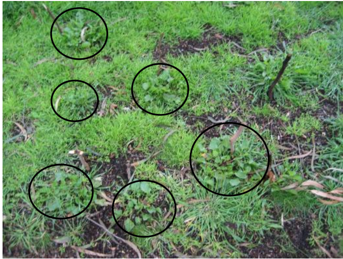
6 Emex australis in 1 m 2

dunes, offshore islands and along roadsides. It is found within conservation areas including the Aldinga Scrub Conservation Park, Coorong National Park, Flinders Ranges National Park and Black Hill Conservation Park.