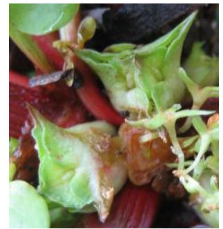
Green fruit

The single-seeded fruit (achene) is woody, green turning red brown on maturity and dull black with age, 7-11 mm long with 3 rigid sharp spines radiating from the apex. Two types of fruits are formed, one underground at the base of the stem and the other above ground in leaf axils. The underground fruits are initially white, somewhat flattened and tend to remain attached to the crown whereas the aerial fruits are initially green, radially symmetric, detach readily from the crown or stems and also have longer spines. The aerial fruits are usually larger. All fruits turn brown on maturing. Viable seed is produced about 6 weeks after flowering.