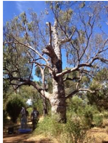
Tree Technique installing the possum guards