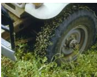
Emex australis