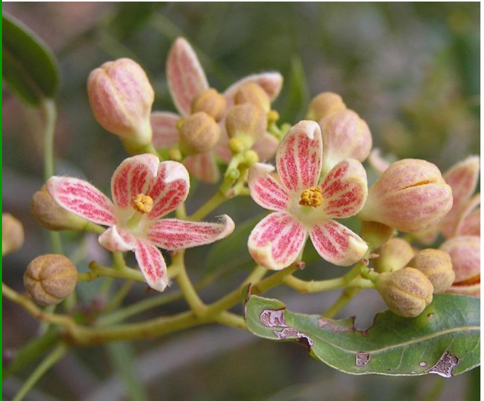
Brachychiton rupestris , Bottle Tree