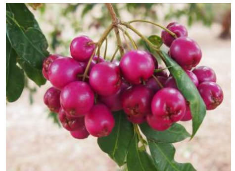
The fruit of Syzygium paniculatum , Brush Cherry, has a pleasantly sour apple-like flavour. Origin NSW, QLD.