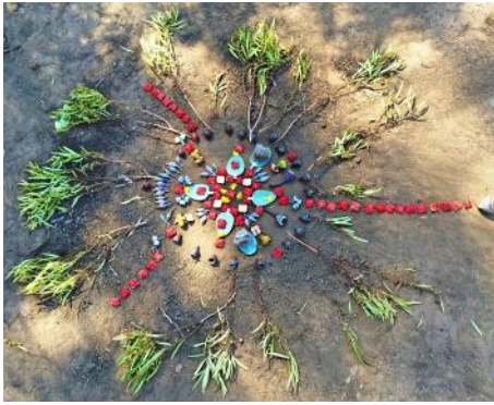
This creative pattern from nature appeared in the mallee block one autumn weekend.