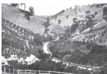
Samuel Finn's cottage at the junction of Chambers Creek with First Creek, 1884

The development and prosperity of Adelaide was dependent, to a large extent, on the resources of the nearby hills. Quarrymen extracted stone for building, tiersmen and their bullock teams brought timber from the densely wooded upper slopes of the Mt Lofty Ranges, market gardens and orchards were planted in the more fertile, well-watered valleys and plains-dwellers escaped to the hills to avoid the heat of summer.