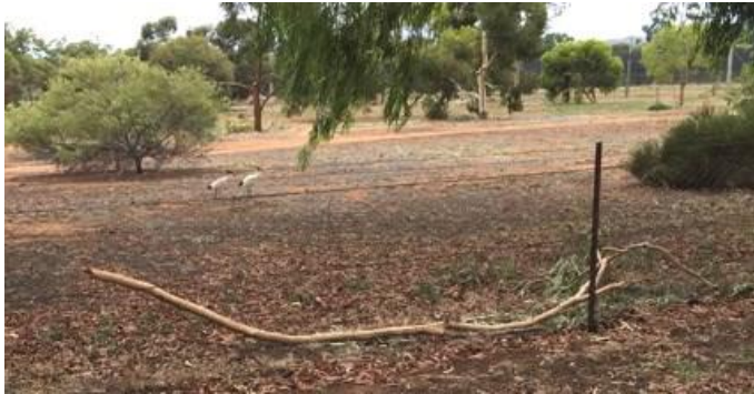
Typical branch shed from a Lemon Scented Gum on Sir Walter Young Avenue.

point of branching of what becomes a lengthening clear branch or major bough. This suggests that the process is linked to lateral tending tissues, the medullary rays. These conduct substances from the outer woody tissue to the centre of the stem.