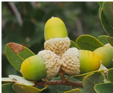
Acorns of Quercus engelmannii , Engelmann Oak. This species is Vulnerable because of its restricted range. Origin California.