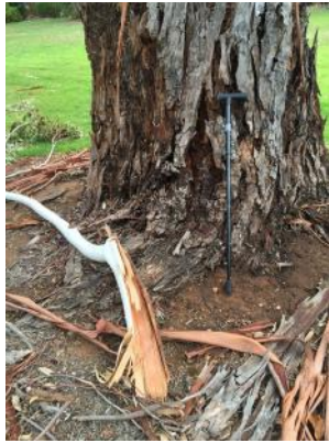
Sydney Blue Gum, shed twigs and branches.

This question came to mind as I crossed a densely wooded section of the parklands. I could not take a step without treading on fallen branches, branchlets and twigs - the accumulation of several years of branch shedding.