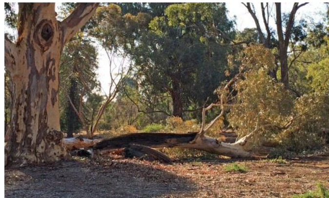
One of the Arboretum Sugar Gums recently shed this large branch.

main pair of trunks. The largest branches I have seen fall there were close to 10 cm diameter and had a ragged but clean break. This break was restricted to a zone of limited breadth. These branch sizes are typical of most broadleaf tree species growing in woodland or forest.