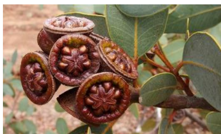
Eucalyptus preissiana subsp. lobata , Bell-fruited Mallee occurs between Albany and Esperance in WA.