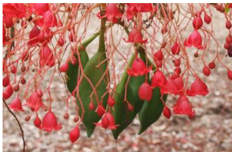
Flowers and fruit of Brachychiton x roseus , Wentworth Flame Tree. It is a natural hybrid between B. acerifolius and B. populneus . Origin NSW.