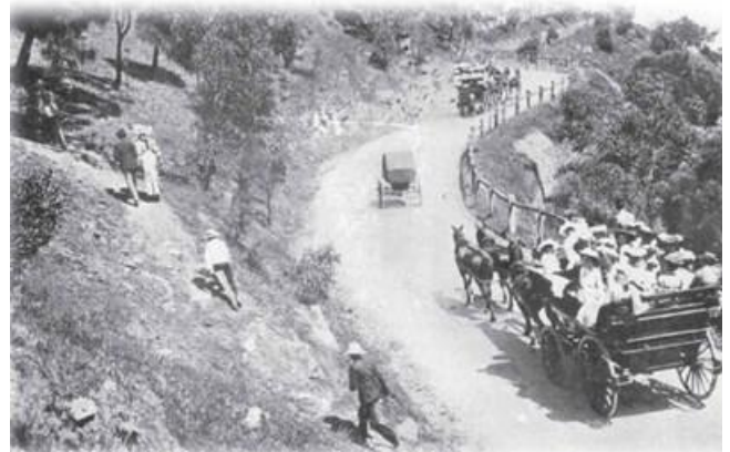
After a day in the park: traffic on the Old Belair Road, early 20 th century.