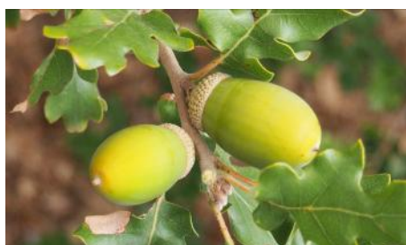
Acorns of Quercus pubescens , Downy Oak. Origin E., C. and S. Europe, N. Turkey.