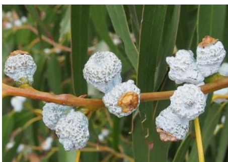
Eucalyptus bicostata , Eurabbie grows in NSW and Vic with an unusual, small, isolated population north of Burra in SA.