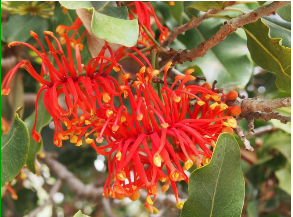
Stenocarpus sinuatus , Firewheel Tree