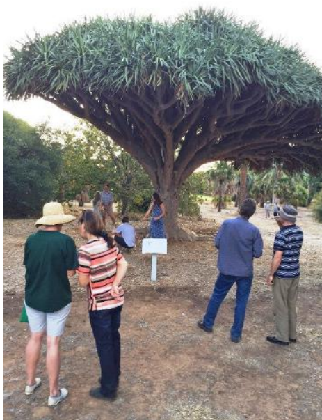
At the Dragon Tree.