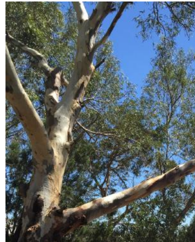
SA Blue Gum showing branch stubs on boughs and main stem.

In deciduous trees, an abscission zone is formed at the base of the leaf stem (petiole). In this zone the top layer has cells with weak walls. The bottom layer expands in autumn, breaking the weak walls of the cells in the top layer, allowing the leaf to be shed.