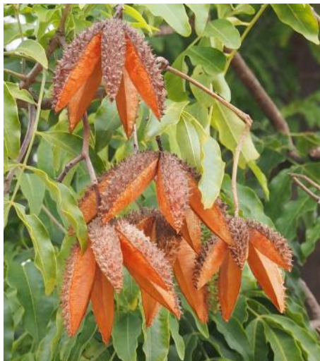
The woody, five-valved fruit of Flindersia xanthoxyla , Yellowwood. Each valve contains 4 to 6 thin, winged seeds which germinate readily. Origin NSW, Qld.