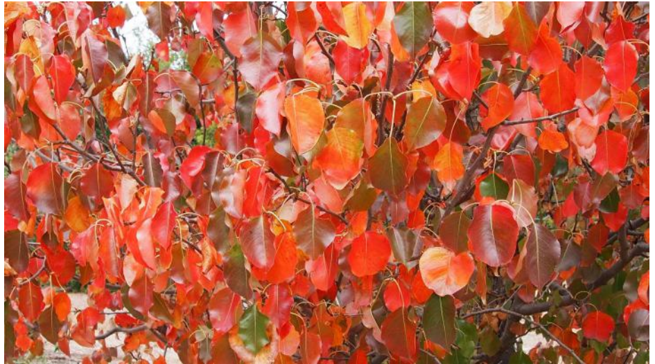
Pyrus calleryana 'Chanticleer' has spectacular autumn foliage. Origin cultivar.