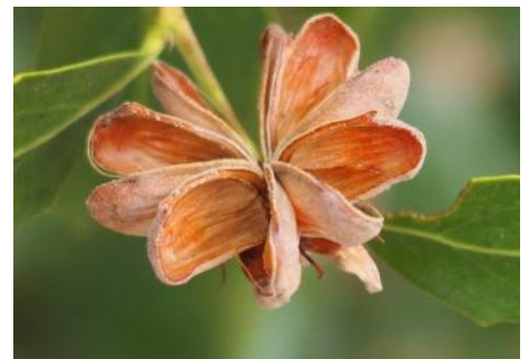
Dry fruit of Quillaja saponaria , Soapbark Tree. The tree's inner bark can be powdered and used as a soap substitute. Origin Chile.