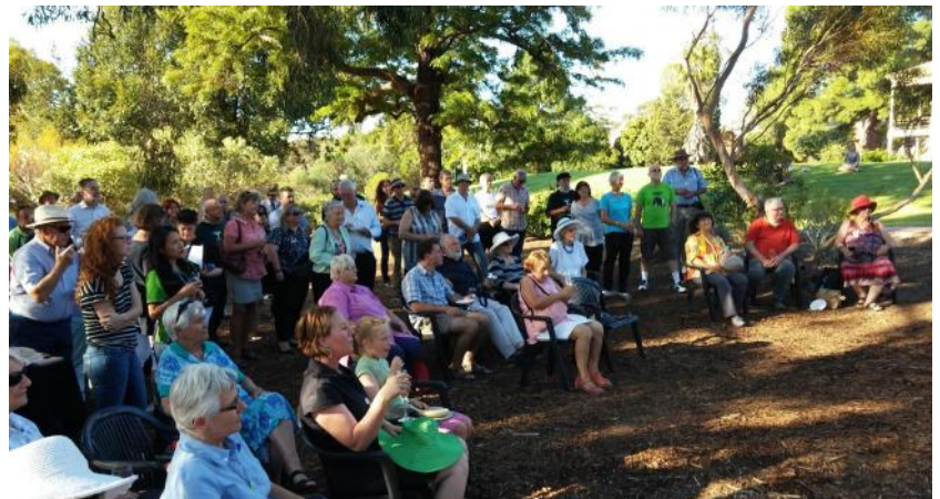
Part of the crowd at the launch.