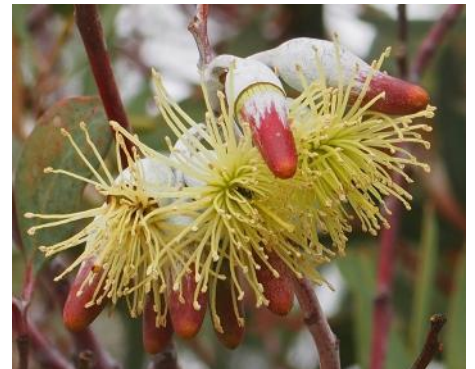
Eucalyptus incerata , Mount Day Mallee is native to south-west WA.