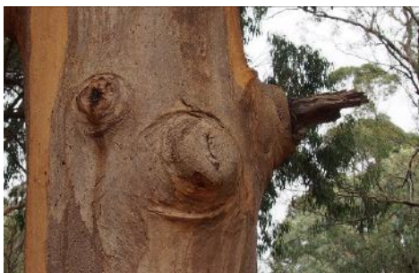
The three branch stubs are each in a different stage of healing over.

point of branching of what becomes a lengthening clear branch or major bough. This suggests that the process is linked to lateral tending tissues, the medullary rays. These conduct substances from the outer woody tissue to the centre of the stem.