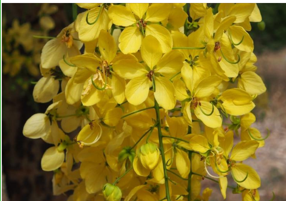
Cassia fistula Golden-shower Tree #500