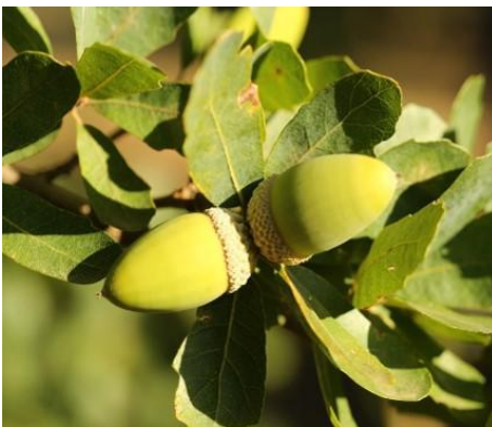
Quercus engelmannii , Engelmann Oak, Mesa Oak FAGACEAE #446A Classified as an endangered species and possibly the most imperilled of all the tree Oaks. Origin California