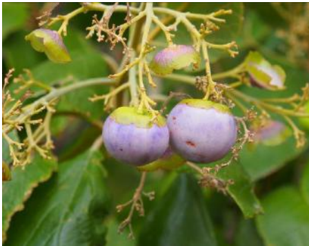
Gmelina leichhardtii , White Beech, VERBENACEAE #152B White Beech is an uncommon fast-growing rainforest tree that was heavily logged in the 19th and 20th c. Origin NSW, Qld