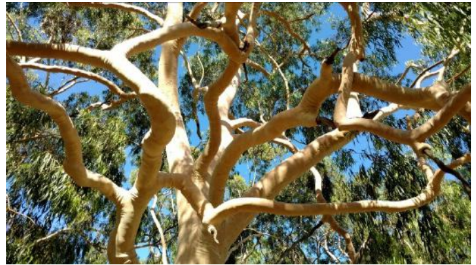
Corymbia citriodora in Walter Young, a different perspective.

In the Arb itself, the native grasses have done tremendously well with the summer rains. The Chloris truncata has colonised large areas, enabling the maintenance of a green swathe, particularly through the Central Arb. We are encouraging the spread of this grass, as it is native, grows and sets seed in both summer and