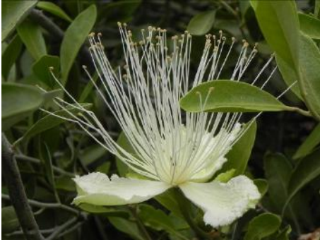
Capparis mitchellii , Native Orange CAPPARACEAE #222. Large white flowers are followed by green egg- shaped fruit which ripen, soften and become fragrant. Fruit is high in Vitamin C. Origin arid Australia