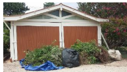
All the weeding and pruning of the day.

before her retirement. To end the day a friendly and relaxed morning tea was shared and a nice shot pictured the moment.