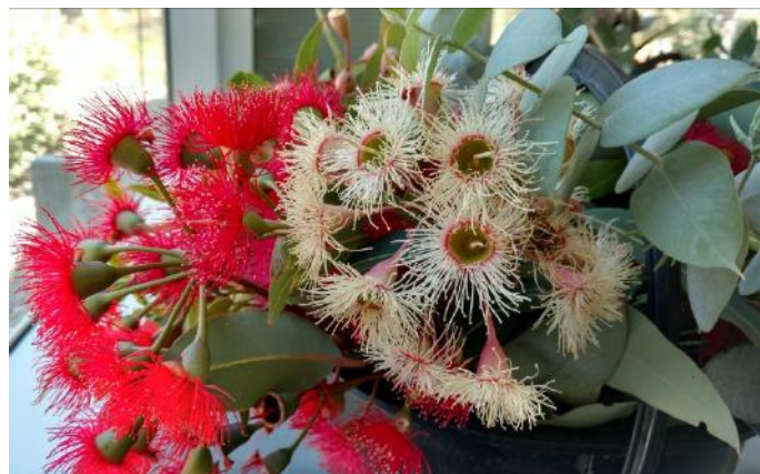
Mixed eucalypt.

Like most Australians, I'd never really thought much about eucalypts. They are simply the backdrop, the