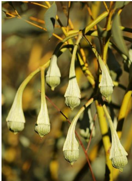
Eucalyptus pyriformis , Pear-fruited Mallee MYRTACEAE #1926A A small tree with attractive ribbed fruits and large red or cream flowers. Origin WA