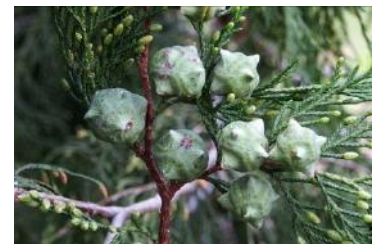
Tree#1024 Foliage and cones

The wild tree grows in the earthquake riven Longmen Shan - the Dragon's Mouth mountains. These remarkable mountains are the result of 50 million years of vertical slippage along the Longmen Shan fault, and rise, in the space of 50 kilometres from 600 m to 6,500 m. The soil is typical of subalpine coniferous forests: acidic, infertile, leached and shallow. At altitudes above 2,000 m, the average annual rainfall is about 500 mm (falling in summer), while in winter the region is under heavy snow. Temperatures range from mild to freezing.