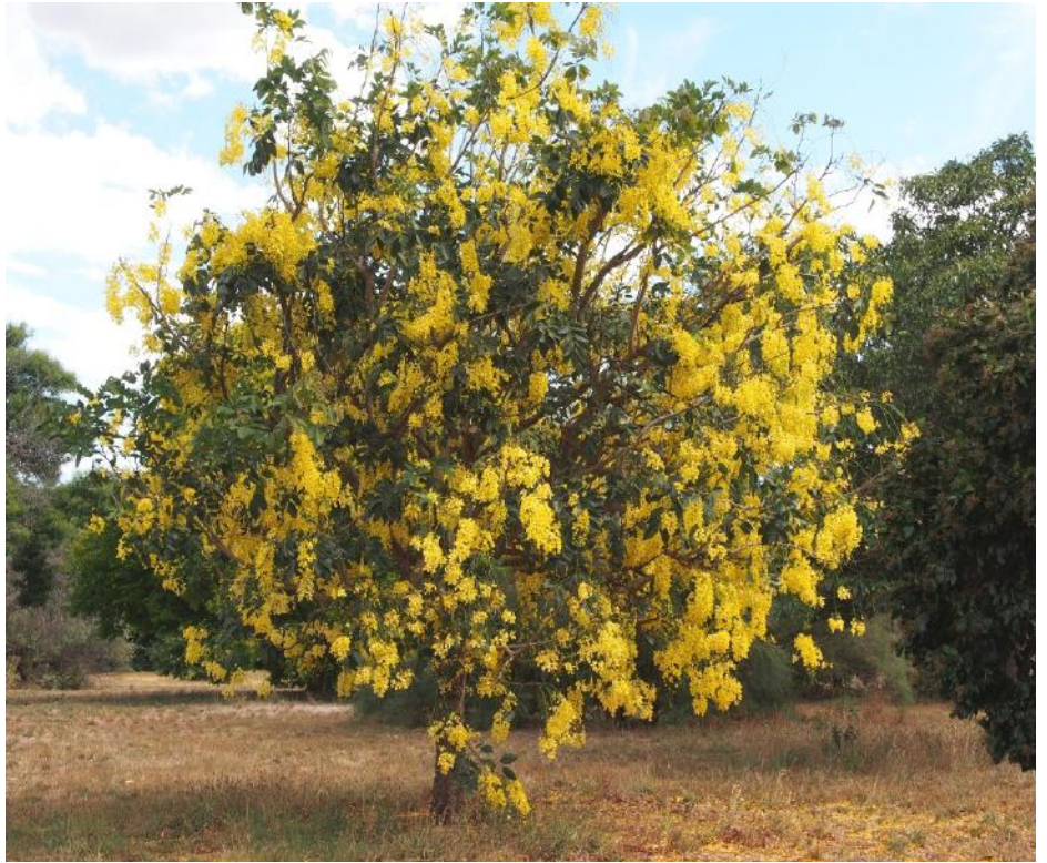
Cassia fistula , Golden-shower Tree FABACEAE #500 The gum, seeds and bark are used medicinally. The fruit is a long indehiscent cylindrical pod with numerous seeds with a pungent odour. Origin India