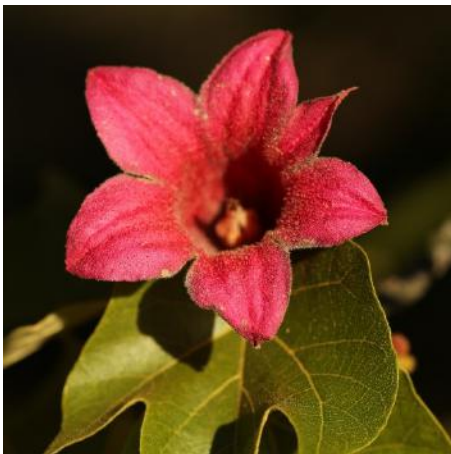
Brachychiton discolor , Lacebark Tree STERCULIACEAE #245 Over 30 species of Brachychiton grow from the rainforest to dry areas of Australia. Origin NSW, Qld