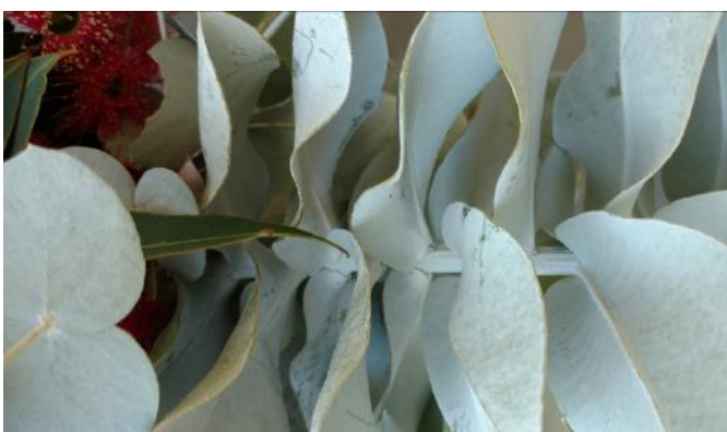
Eucalyptus macrocarpa.