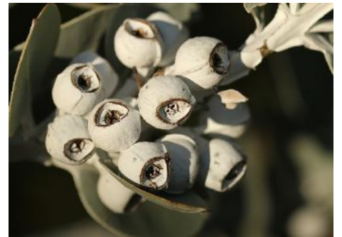
Eucalyptus pleurocarpa , Tallerack MYRTACEAE #1922A Decorative mallee with white, waxy leaves, buds, fruits and stems. Origin WA