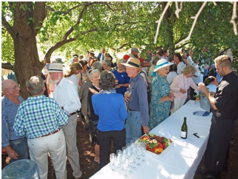
The gathering under the Pear Trees.