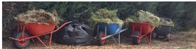
The result of the volunteers' hard work.