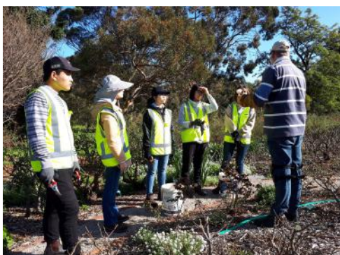
Horticulture students in the Urrbrae House rose garden.