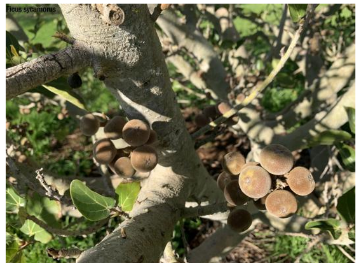
Ficus sycamorus Egyptian Sycamore #876 1973 Tropical and S Africa. In tropical areas where the wasp is common, complex mini ecosystems involving the wasp, nematodes, other parasitic wasps, and various larger predators revolve around the life cycle of the fig. The trees random production of fruit in such environments assures its constant attendance by the insects and animals which form this ecosystem.