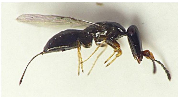
Female Fig pollinator wasp, Family AGAONIDAE

https://www2.palomar.edu/users/warmstrong/pljun99b.htm