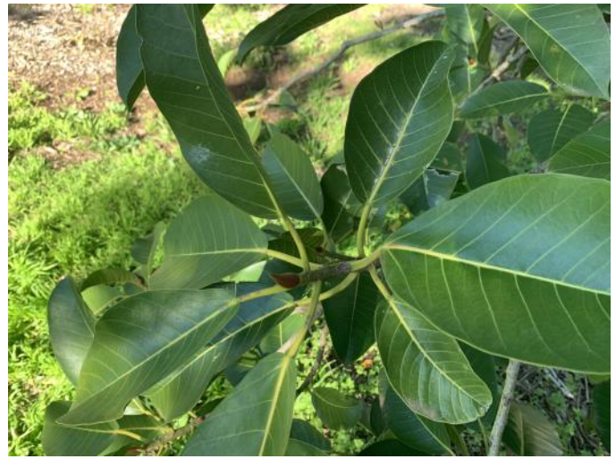
Ficus elastica 'Decora' Broad-leaved Indian Rubber Tree. #895 1962. Native to eastern parts of South Asia. The fruit is a small yellow-green oval fig 1 cm long, barely edible; these are fake fruits that contain fertile seeds only in areas where the pollinating wasp is present.