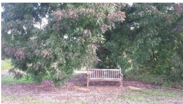
Nearby tree species:

The Chambers family shared a great fondness for the Waite Arboretum. During the previous months many people have enjoyed the Waite Arboretum, a unique and special place to visit, especially during these times of social isolation.