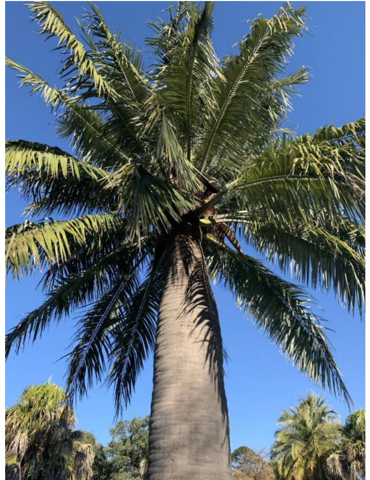
Jubaea chilensis Chilean wine palm ARECACEAE #392 Chile 1928

Jubaea is a mono-typical genus, that is, there is only one species of Jubaea though it is closely related to the widely known Butia and to the rare Jubaeopsis of South Africa, to which it is in many ways similar. Jubaea is essentially a non-tropical palm, preferring mild summers and cool winters for optimum growth. Its tolerance of frost is surprisingly high; in fact it is probably the most frost-tolerant feather leaved palm.