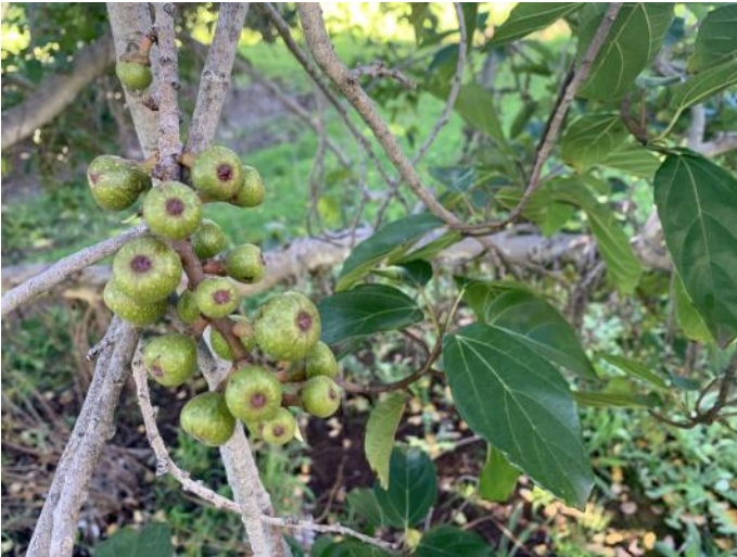
Ficus sur Cape fig #975 1957. This is a widespread Afrotropical species of cauliflorous fig. The figs are edible and utilized in fresh or dried form by native people in many regions.