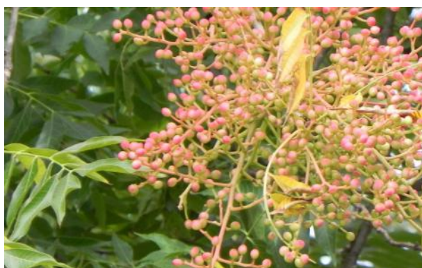
Fruit and leaves P. chinensis .

P. chinensis Chinese pistachio #862 B8 ANACARDIACEAE China Japan, Philippines 1929. Dioecious, with separate male and female plants. The fruit is a small red drupe, turning blue when ripe, containing a single seed. It is a popular choice for street trees in urban settings because it is very drought tolerant and can survive harsh environments.