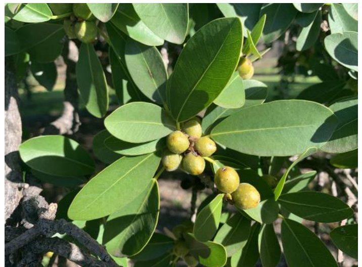
Ficus retusa Malay Banyan #973 SE Asia 1947. It has a grey to reddish bark dotted with small, horizontal flecks, called lenticels, that are used by woody plant species for supplementary gas exchange through the bark.