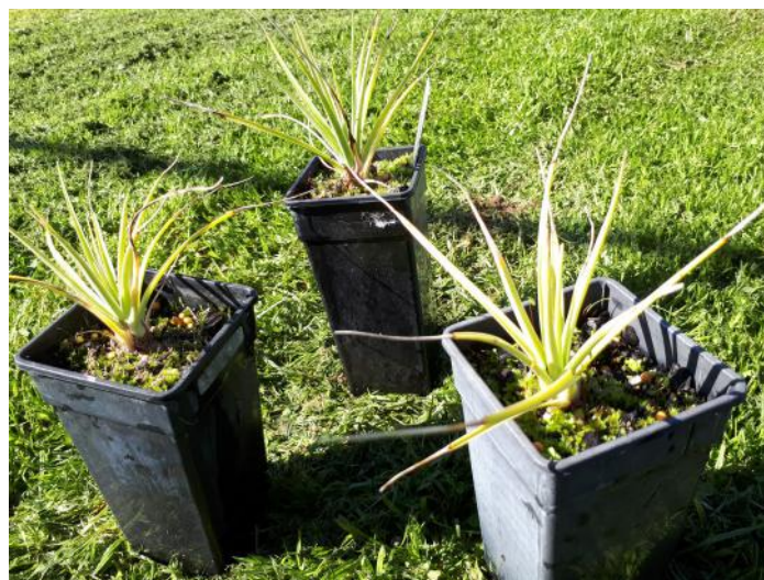
Seedlings for sale— Dracaena draco subsp caboverdeana