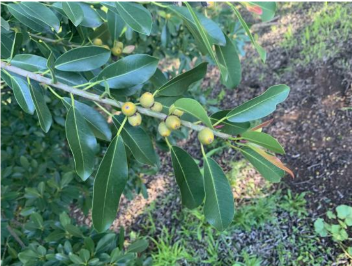
Ficus watkinsiana Green-leaved Moreton Bay fig #896 NSW QLD 1938. A strangler fig, with edible fruit. Leaves elliptic with long petioles (4-7 cm). The receptacle turns dark purple with pale spots and has a prominent nipple and is called the Nipple fig.