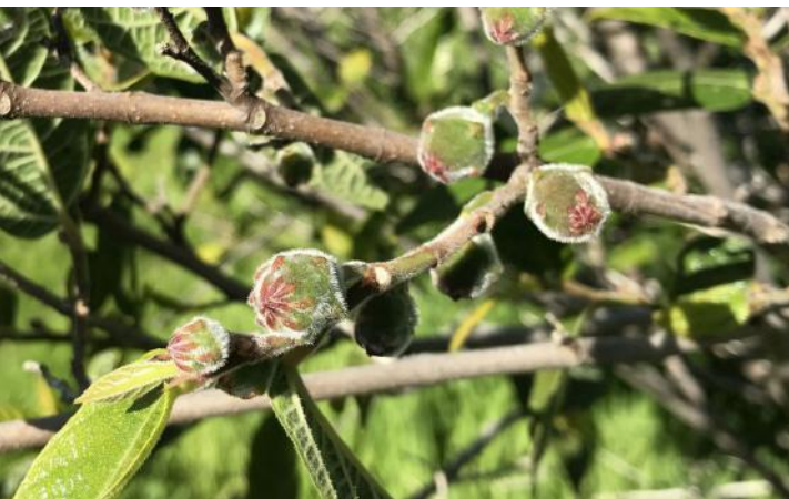
Ficus coronata Sandpaper fig #177 QLD, NSW, VIC. NT 2003. The fruit is succulent but covered with bristly hairs. Ficus coronata serves as a food plant for the caterpillars of the Queensland butterfly or Purple Moonbeam ( Philiris innotatus ), the Australasian Figbird ( Sphecotheres vieilloti ), Green Catbird ( Ailuroedus crassirostris ), Olive-backed Oriole ( Oriolus sagittatus ), Topknot Pigeon ( Lopholaimus antarcticus ), and Grey-headed Flying Fox ( Pteropus poliocephalus ).